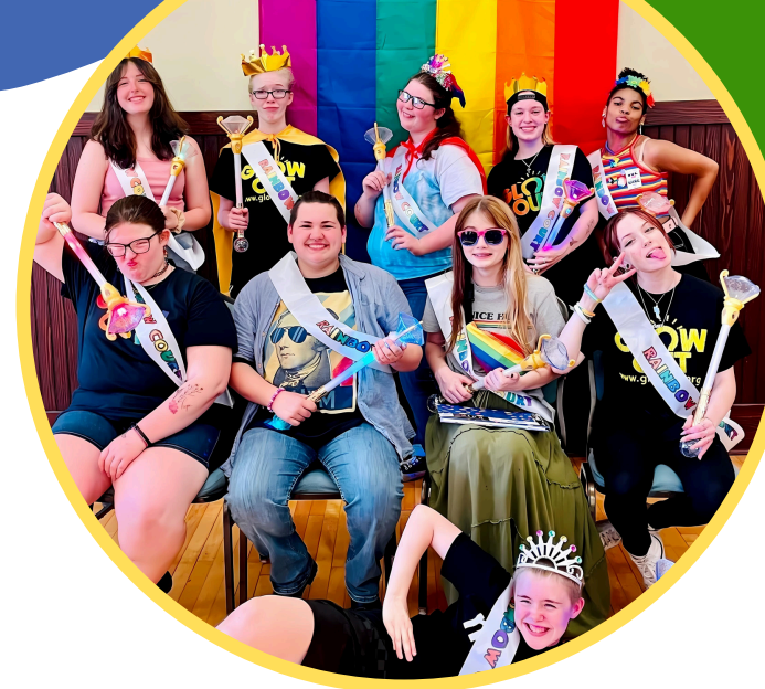
Rainbow Youth Court, Pride 2023

Visit our website for more information on educational workshops, or email us to talk about customized sessions for your group.